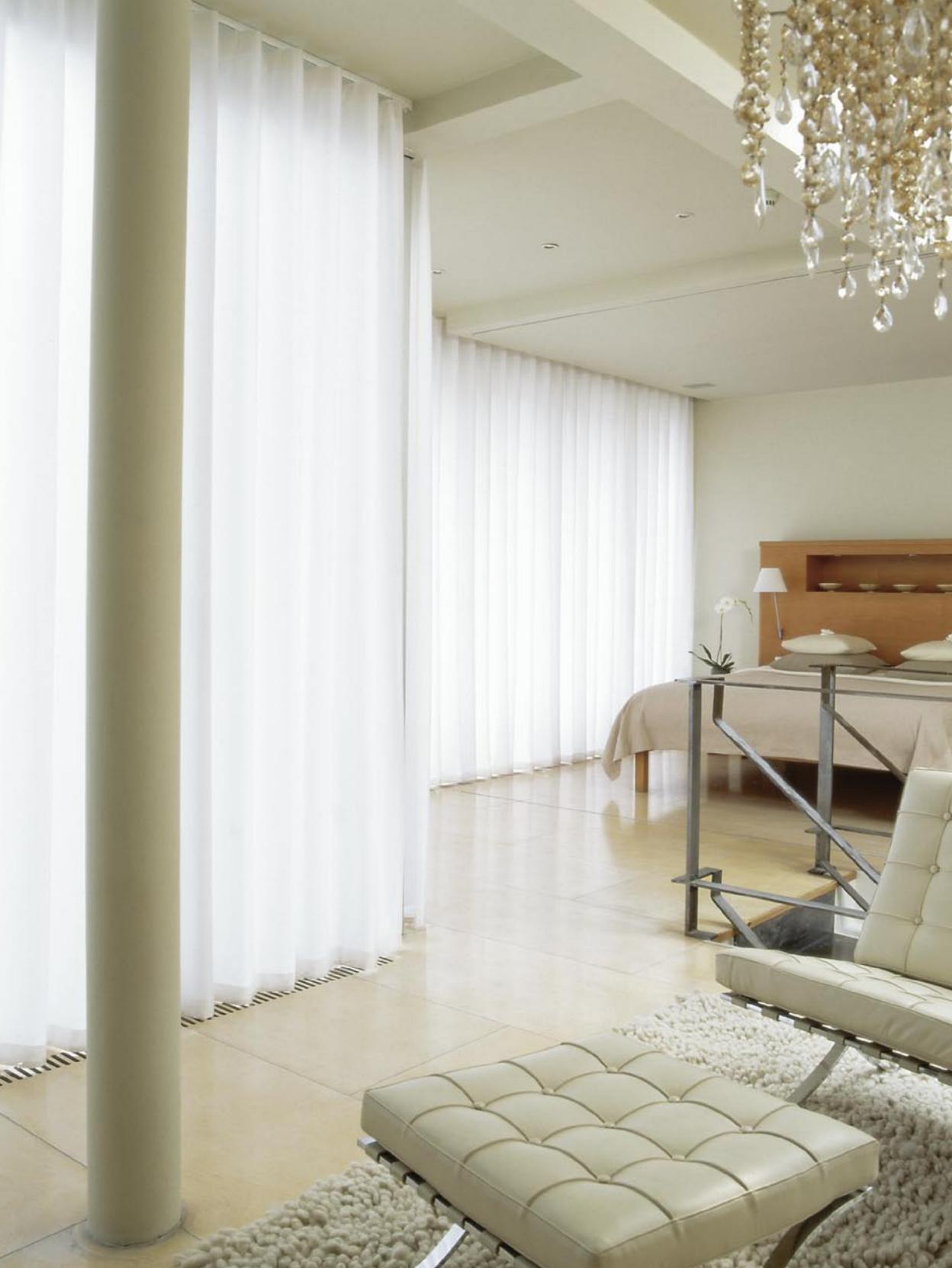
Wave with Silent Gliss 3840

Wave – A new contemporary drapery heading system combining simplicity and style